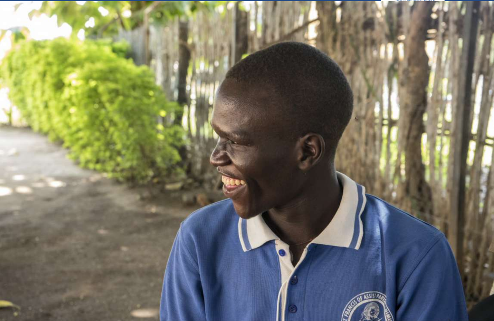
Photo: Young peace builder trained by JRS, at Adjumani compound.