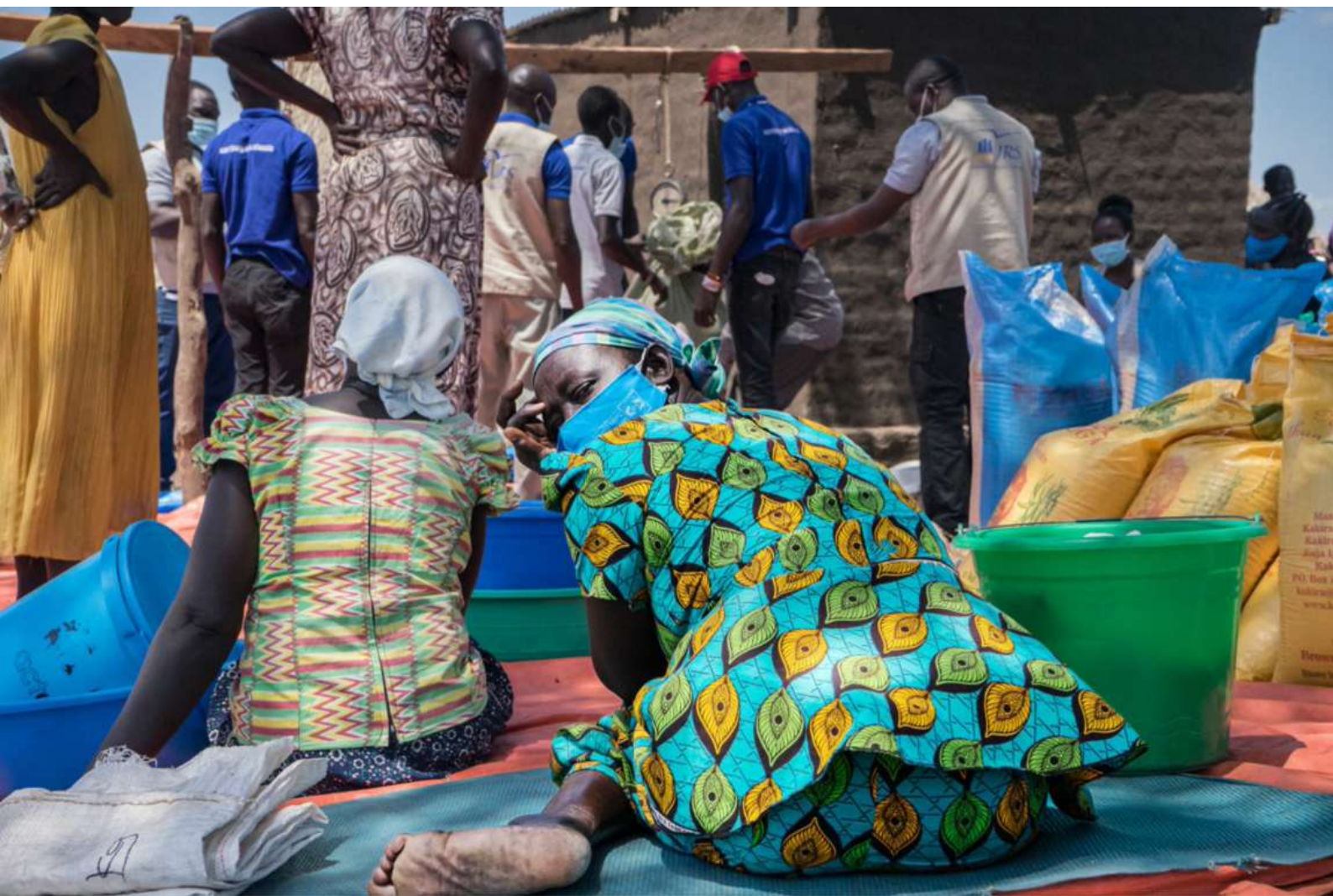
Photo: Refugee women waiting for their ration during a food distribution in Moyo.