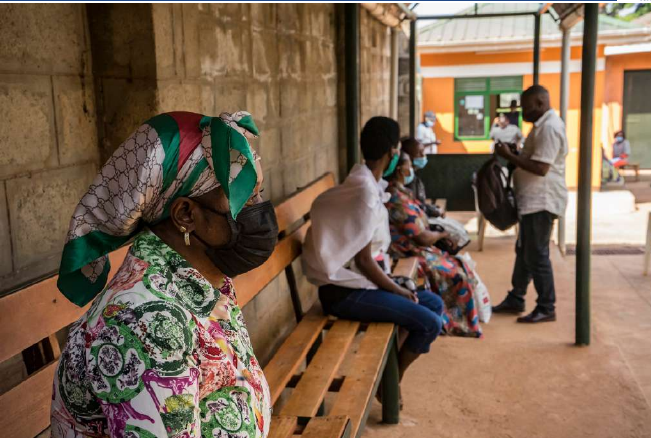
Photo: Refugees at JRS Kampala compound waiting to be attended.