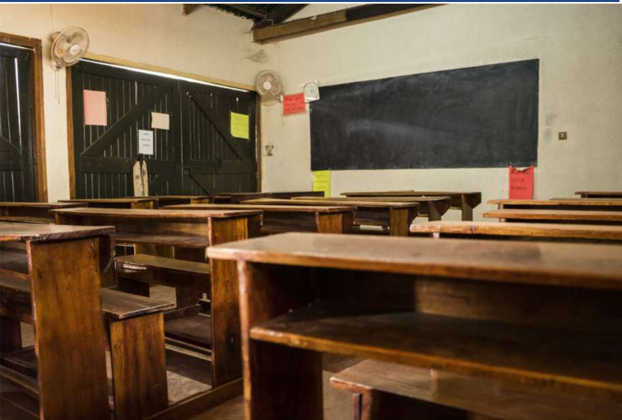
Photo: One of the classrooms for English courses at JRS Kampala compound.