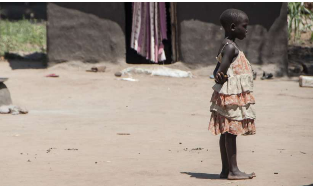
Photo: Refugee girl in Moyo.

But even then, it is difficult to get movement permits. So staffs have challenges in access