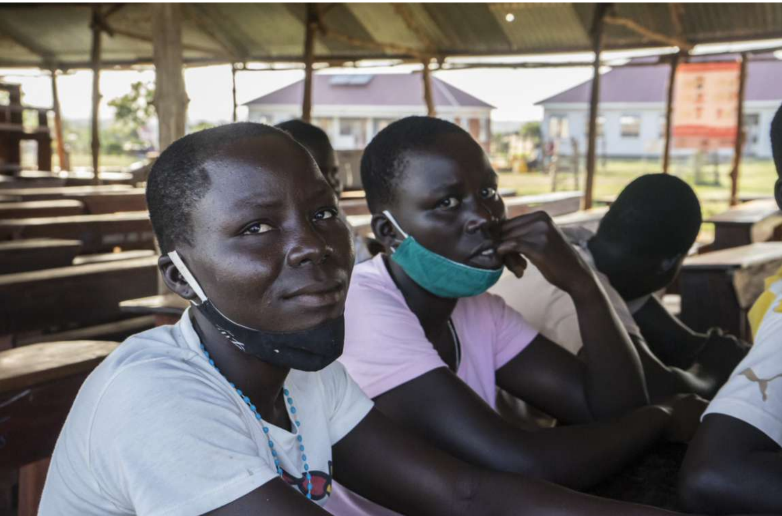
Photo: Group of refugee students in Pagirinya school premises.

During this month, these sites will be officially handed over to the contractors who were successful in the bid selection as follows; Pagirinya awarded to East and West Construction Company and Mungula to Nile Joint Operation Limited. The Site handover Ceremony will be graced by the DEO, OPM, BOG/PTA, UNHCR and the School management respectively. The BID evaluation was conducted by the JRS Procurement committee