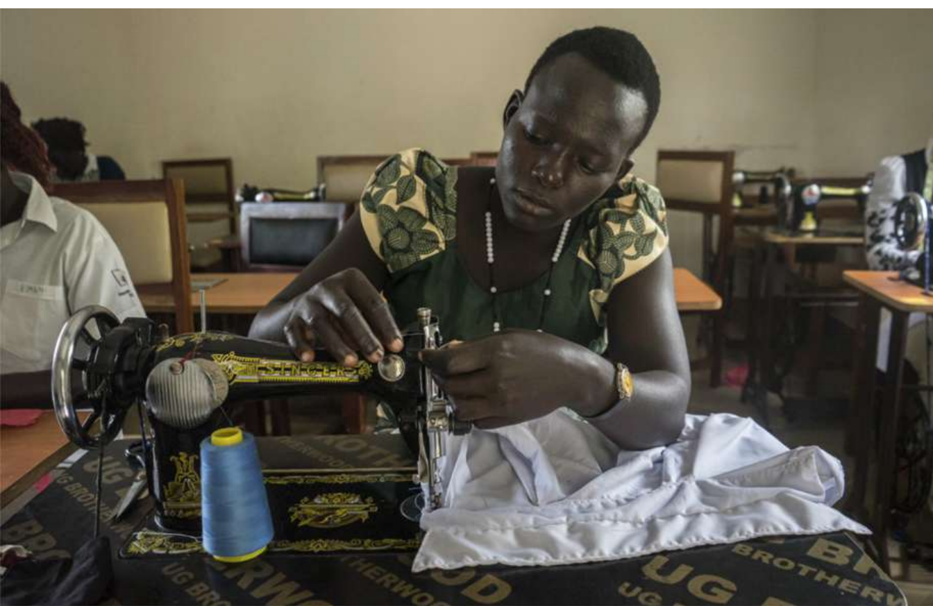
Photo: Tailoring class at JRS Adjumani for young mothers.