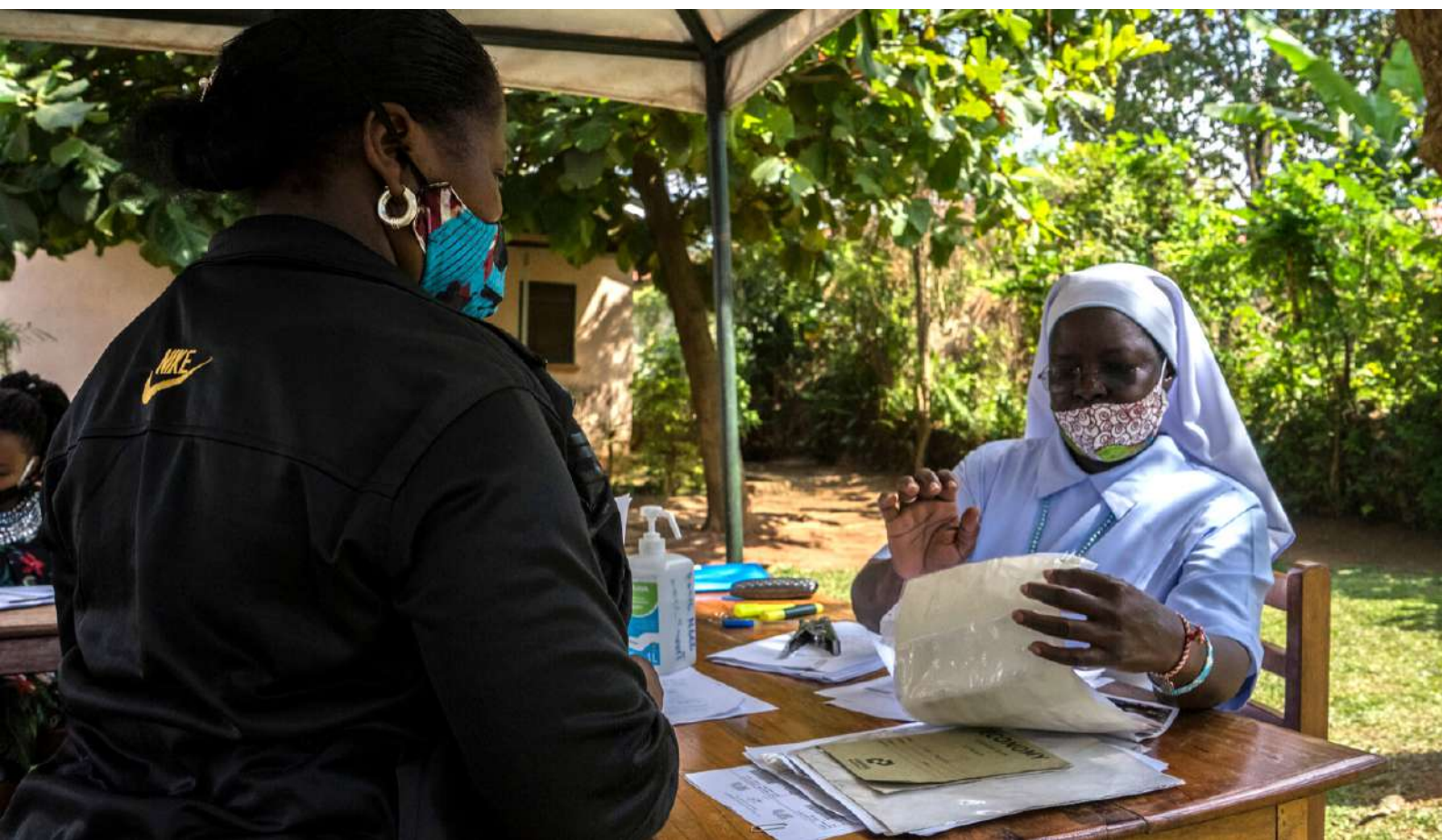
Photo: Refugee woman being attended by one of our staff for assessment.