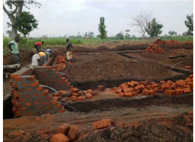
Ongoing construction of the girl's dormitory (21/07/2021)