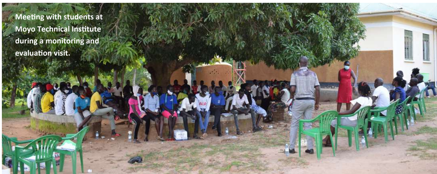
Meeting with students at Moyo Technical Institute during a monitoring and evaluation visit.