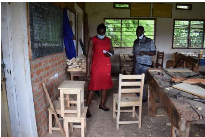
The M&E officer inspects items made by the carpentry students.