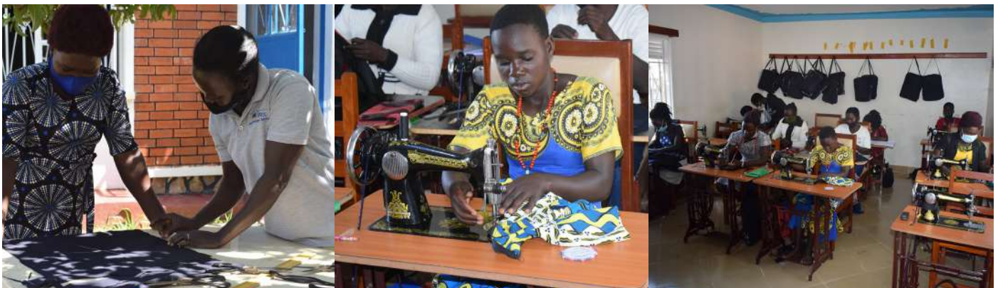
Tailoring students attending class at the JRS Adjumani office.

Impoverished girls, school drop-outs, teenage and single mothers in Adjumani district learning tailoring and business skills to improve their standard of living, enable them improve the care for their children and contribute to the economic recovery of their communities