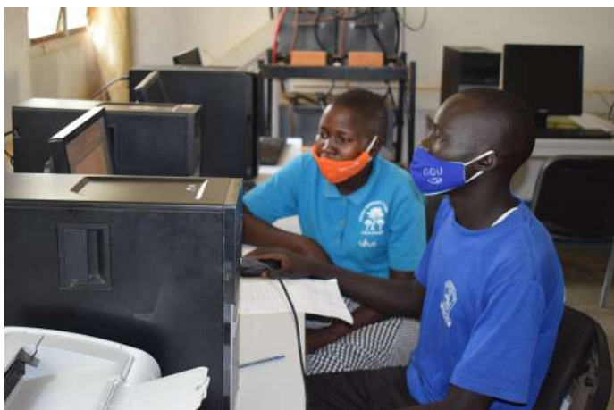
Students at the computer laboratory at the institute.