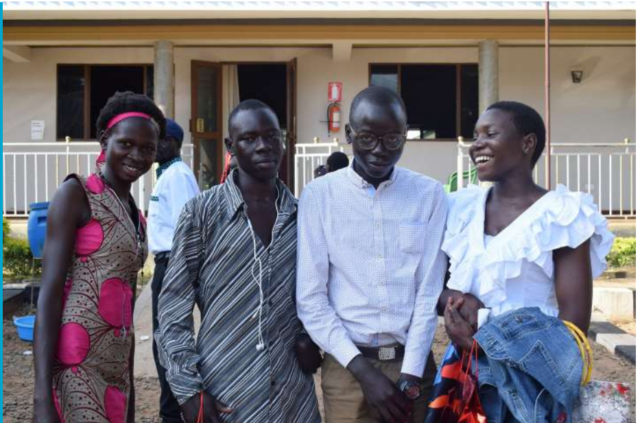
Students who attained a first grade in the UCE 2020 examinations.