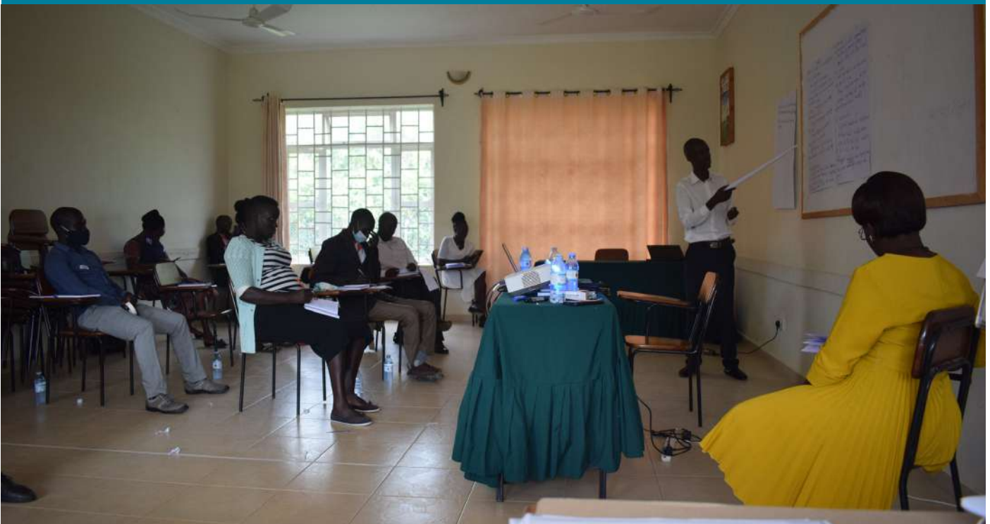
Group presentations during the training session. 54(39M, 15F) participants attended from 5 refugee settlements.

12-13/ 08/ 2021, Nyumanzi, Ayilo, Pagirinya, Lewa and Maaji Refugee Settlements. 54 (39m, 15f)