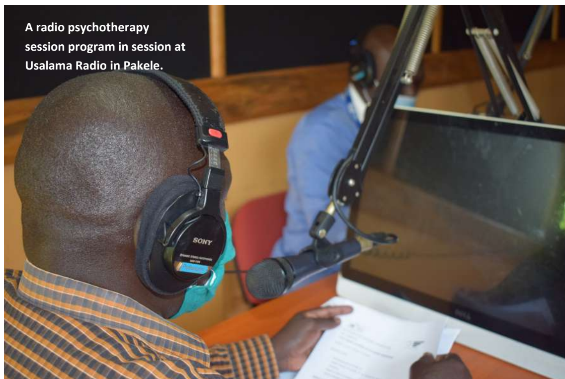
A radio psychotherapy session program in session at Usalama Radio in Pakele.