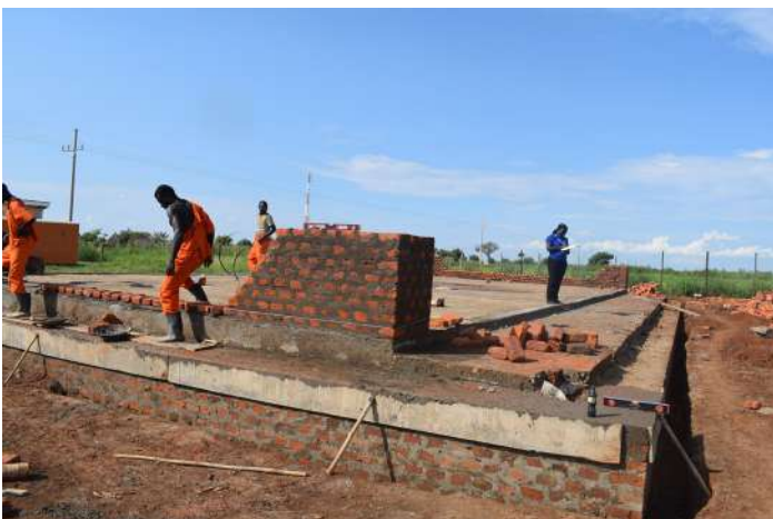
Monitoring team visiting the school to check on the progress of the laboratory construction. (29/07/2021)