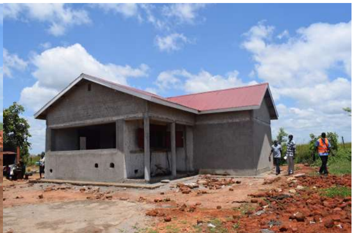
Monitoring team visits the Kitchen under construction at Pagirinya during a routine weekly inspection. (14/10/2021)