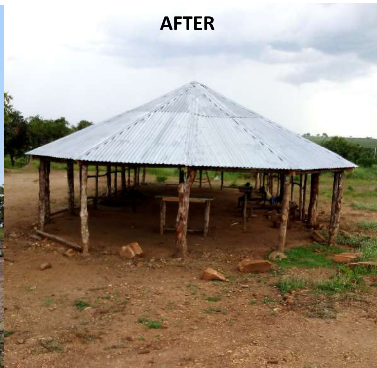
St Kizito Chapel before (after the storm), and after the re-construction.