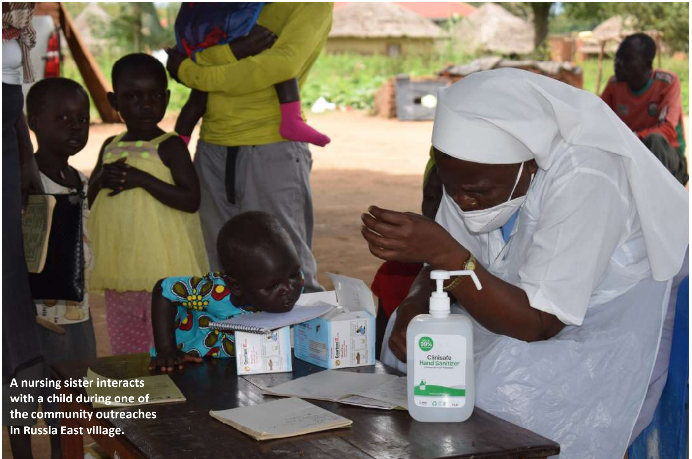
A nursing sister interacts with a child during one of the community outreaches in Russia East village.