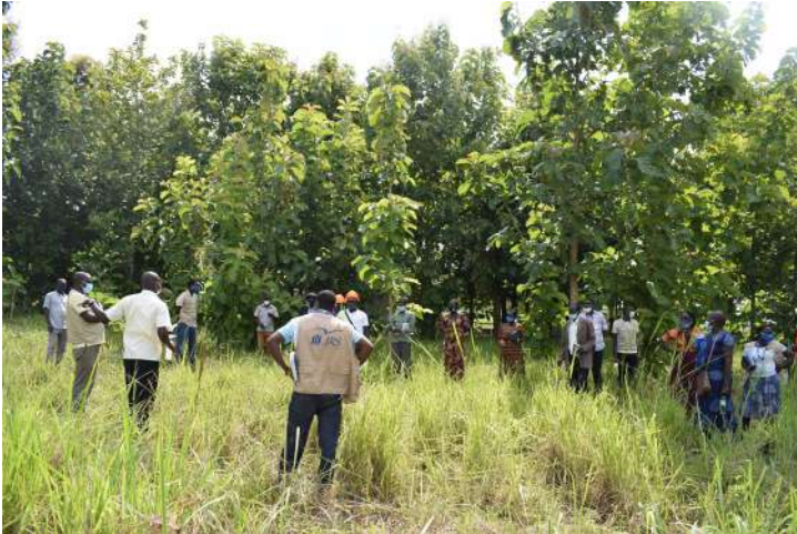
Ground breaking for the construction of the girl's dormitory at Mungula SS on 1/07/2021.