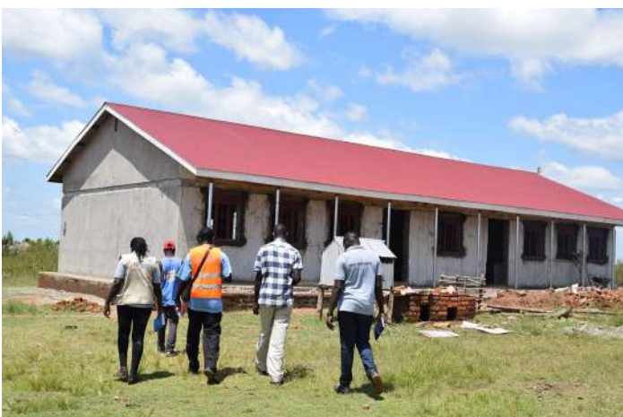
The team—JRS M&E and engineer, and district engineer during a routine supervision. (14/10/2021)