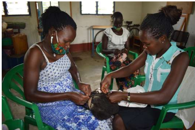
Students taking part in the hairdressing class.