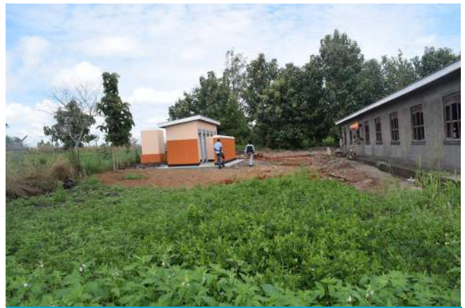
Inspection of the washrooms and incinerator by the monitoring team. (09/09/2021)