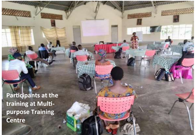
Participants at the training at Multi-purpose Training Centre

One of the key conflict drivers in the society is irresponsibility which has led to family breakups as stated by participants.