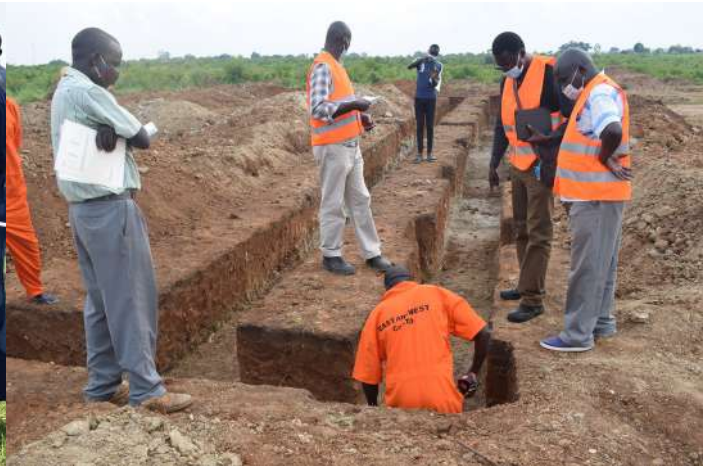
Digging the foundation for the girl's dormitory. Looking on is the district engineer and the contractor. (14/07/2021)