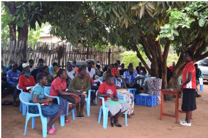
Vocational students meeting at the JRS office before heading to school

Vocational skills training for persons with vulnerability at Moyo Technical Institute (MTI). Courses offered include: Tailoring, Hairdressing, Welding, Building, Carpentry, Electrical and solar installation, Motorcycle repair and Plumbing.