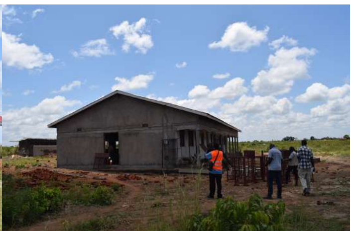
Girl's dormitory and washrooms under construction. (14/10/2021)