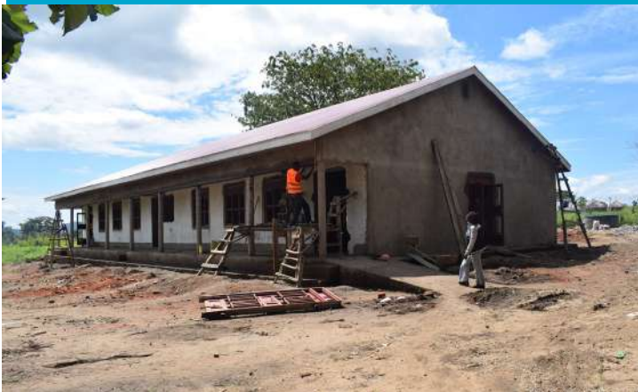
The monitoring team inspects the construction site at the school during their weekly monitoring. (09/09/2021)