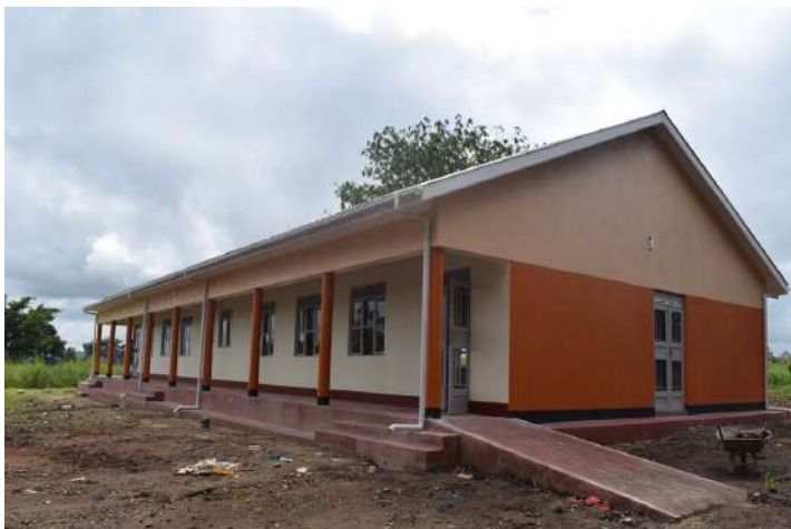
The completed girl's dormitory at Mungula SS. (14/10/2021)