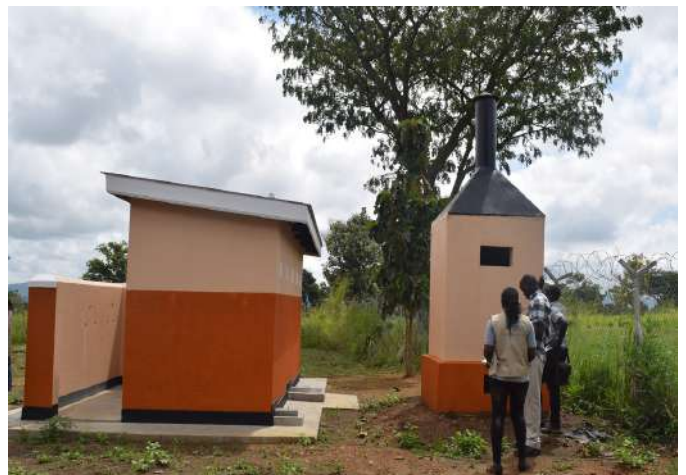
JRS M&E, engineer and contractor check out the finished incinerator during a routine monitoring visit. (14/10/2021)