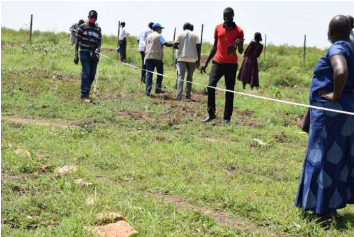
Ground breaking for the laboratory construction at Pagirinya SS on 1/07/2021.