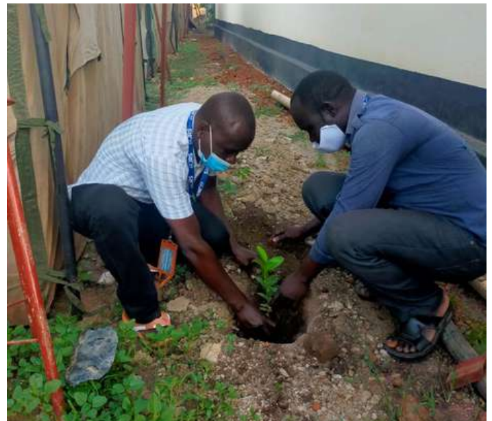
Members of the Psychosocial Program participate in tree planting fun event. They believe in fruit trees.