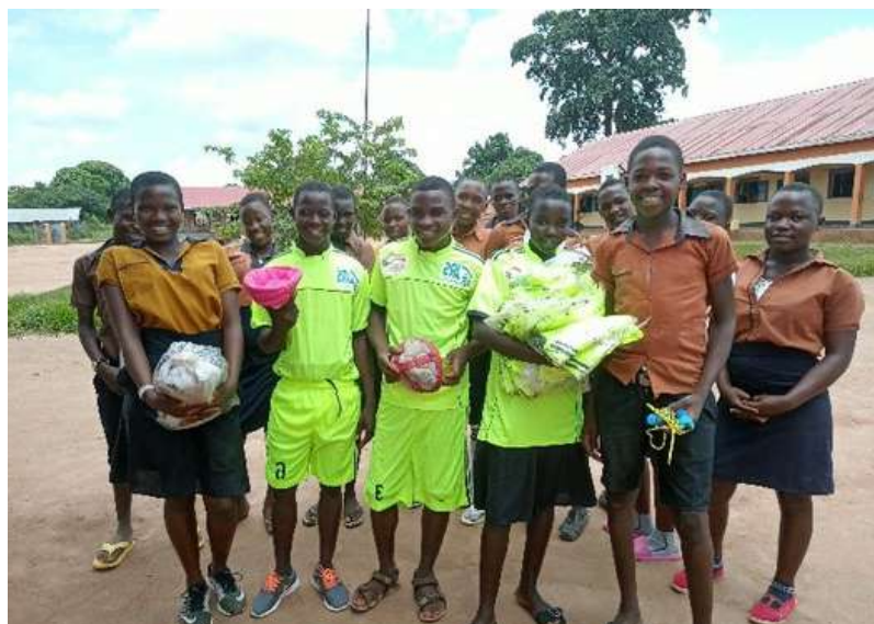
Peace club receiving sports items to support Recreational activities.

these peace club brings together children's from diverse backgrounds through recreational and sporting activities .to equip them with; effective coping mechanism to mitigation the harmful effect of exposure to violence; and inessential life –skills that promote tolerance, conflict resolution skills and understating of human rights, child right and non-discrimination