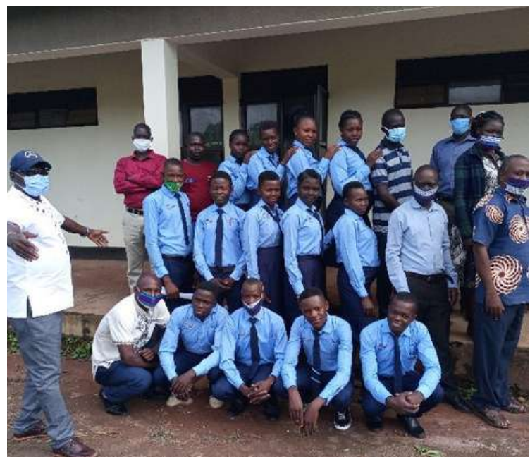
The Pre-service Teacher Trainees with the Tutors. JRS education Coordinator visited them to encourage them to be committed students in order to succeed.

Tutors taking care of the babies when their mothers are attending classes. The mother-students do not have baby sitters.