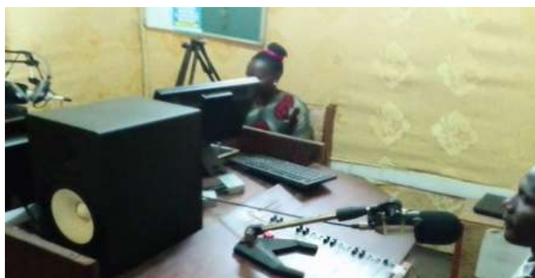
JRS Team during a awerines campain on air throuth a radipo tlak show