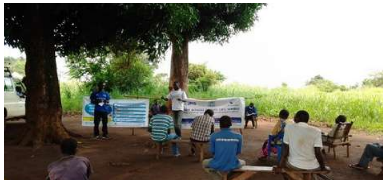
JRS Team during a awerines campaigning in yambio

JRS team managed to raise awareness to 1, 427 individuals through awareness raising activities on hygiene promotion and COVID-19 prevention. This action has created a positive impact in the community and it has encouraged the use of mosquito nets in the houses as a way of reducing incidence of infection from malaria. Following COVID-19 measures, JRS have ensured communities observed regular hand washing and wearing of face mask and this was made possible by the door-to-door [sportive monitoring of the home visitors. JRS carried a community awareness of the risk communication of the pandemic to community member including sending information and messages to the general public , using the radio talk show , disterbuation of materal support to figth Covid-19