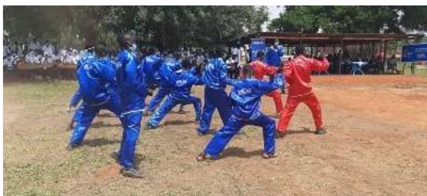
A beneficiary of JRS psychosocial Program in Maban - practice performance of Ticondo sport