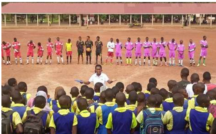
This is a picture of a peacebuilding officer briefing childrens during interschool Friendly match