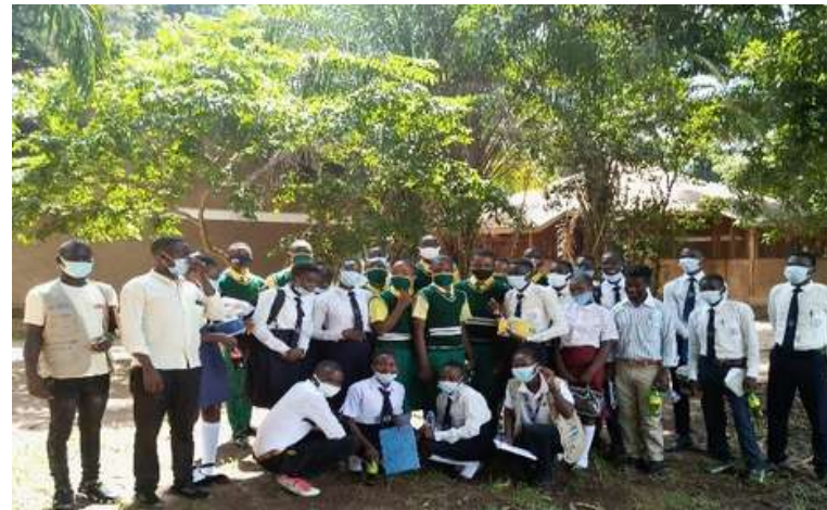
Group pic after the debate with students from