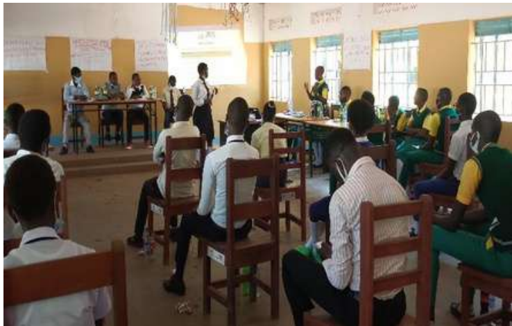
Expression by debate speaker during debate

JRS Education program include School activities like Sport, group Discussions and Debates are important for building social and peacebuilding among students whom are from differed background's .