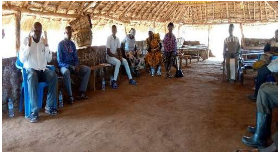
Inter-religious dialogue at Ezo County

JRS intervention mobilizes religious leaders through quarter session engaging dialogue on social justice issues for marginalized and vulnerability group. Both traditional leaders and religious leaders within the context are considered custodians of communal of values system and have the authority to positively influence change in customs and traditions, to reinforce women rights and the human right of the society marginalized groups.