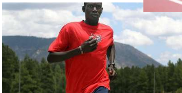
From refugee to Olympian - Cuor Maker at 2016Game Rio comes as a flag Bearer for South Sudan First Olympics Team .