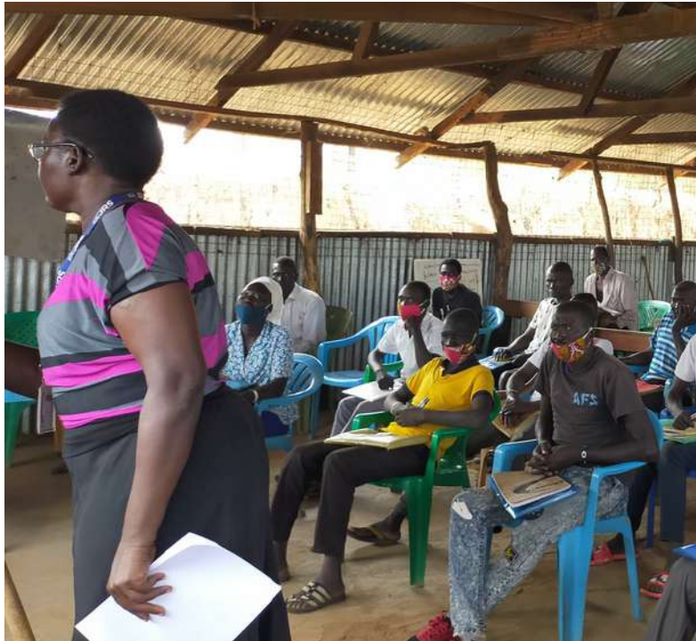
Teacher flora teaching English -student in daro Refugee camp .