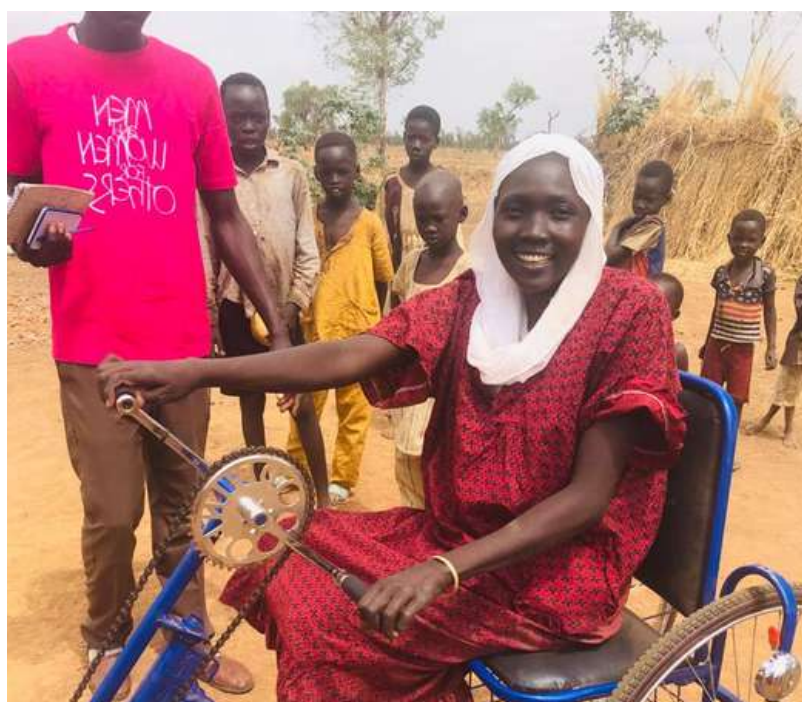
A beneficiary of JRS psychosocial Program in Maban on her new wheelchair

JRS 8 caregivers support group with 118 participants in Maban were facilitated in Daro Batil kaya and Gendressa refugee camp, they learned of their children disability situation ,they made progressive step from feeling only vulnerability to a status of openness and strive for willingness and right of their children with disability .