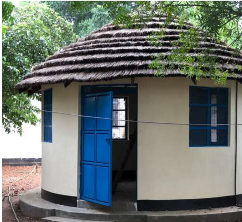
Maban new Chapel from out site

Our team members are also encouraged to spend some quiet reflective time in our small chapel and savour their daily experiences. Keeping a track of how the Holy Spirit labours through our daily activities may bring us to deeper invitations by the Spirit that animates us. We have also deliberately taken a proactive action towards the environment.