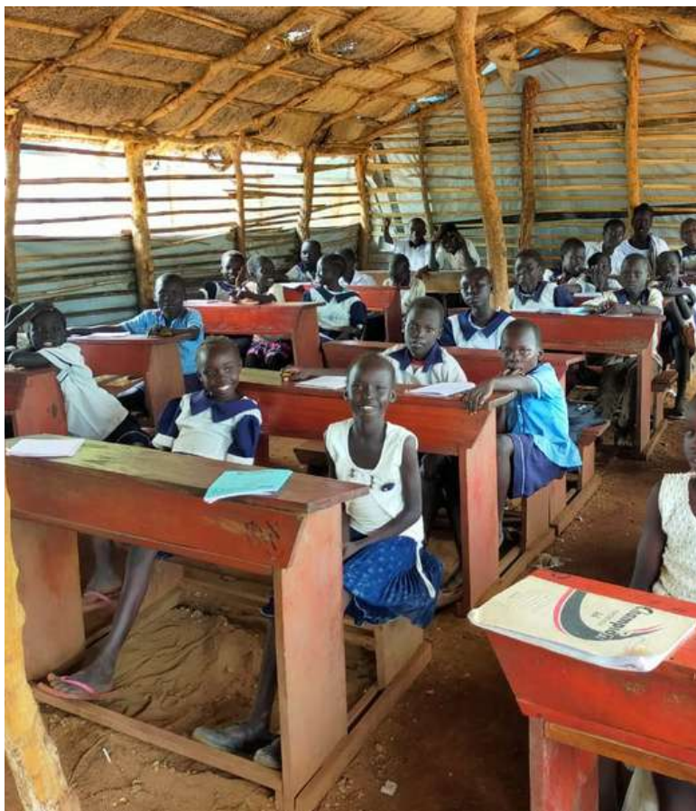
Refugee children at Center 5 playing inside and outside the class