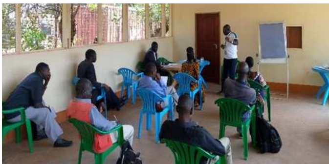
Church Leaders during Inter-Religious Dialogue in Yambio