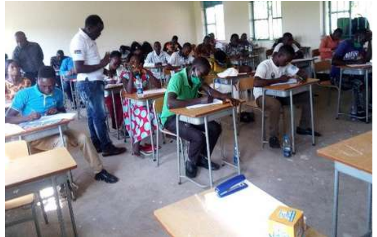
Pre-Service student for end of semester assessment tests and Yabongo Girls Boarding school which was offered for JRS to use by the State Ministry of General Education and Instructions