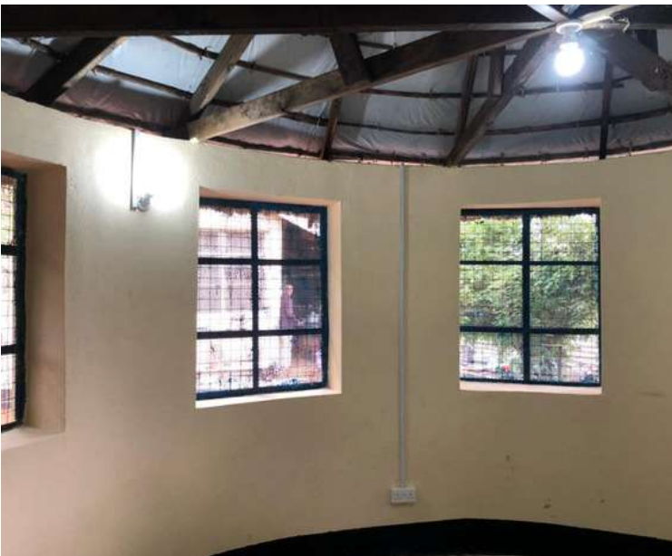
Maban new Chapel from in site