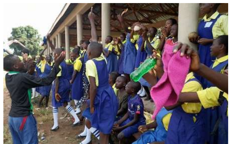
Childrens celebrating over a score by their team.