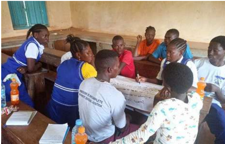
Group discussion during the life skill training

School activities ,Sport, group Discussions and Debates