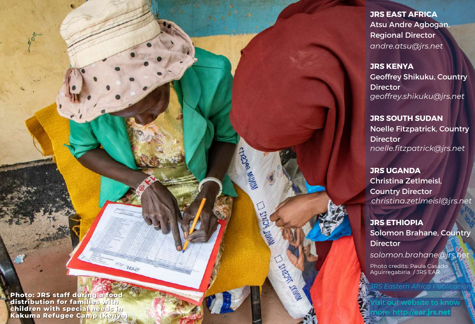
Photo: JRS staff during a food distribution for families with children with special needs in Kakuma Refugee Camp (Kenya)