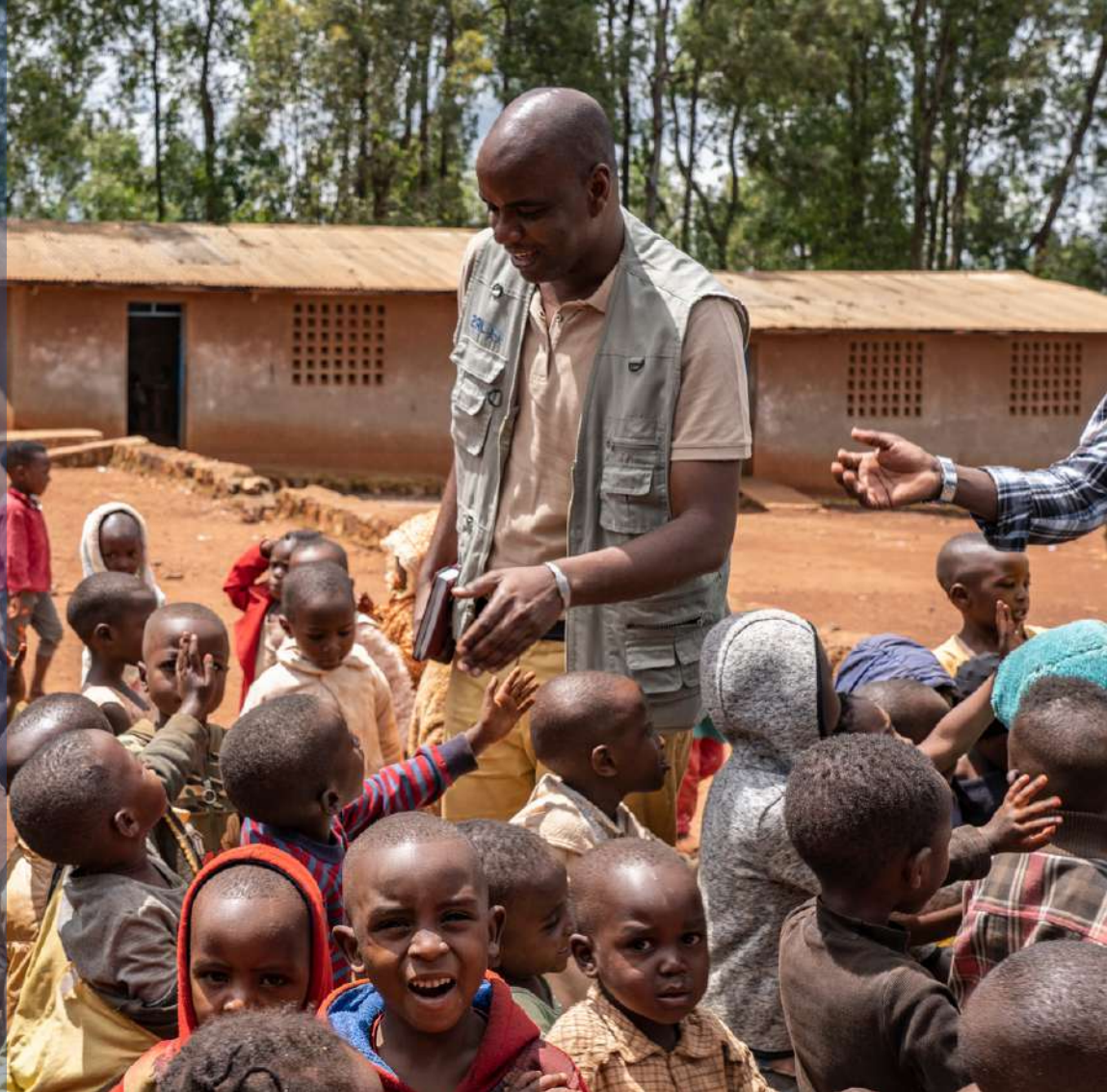
Photo: JRS Burundi and Tanzania Country Director during a school visit in Musasa (Burundi)

TO ACCOMPANY, SERVE, AND DEFEND THE CAUSE OF REFUGEES AND FORCIBLY DISPLACED PEOPLE WORLDWIDE